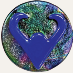
Hall of Fame Pin